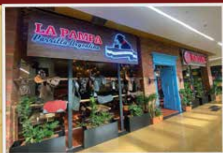
ENVIGADO - C.C CITYPLAZA