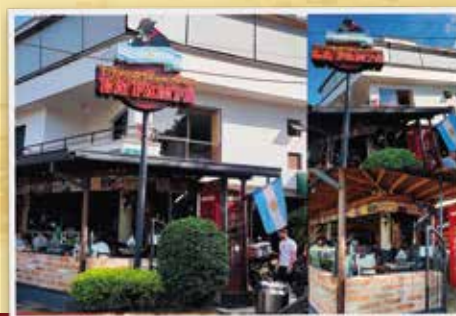
PRIMER PARQUE DE LAURELES