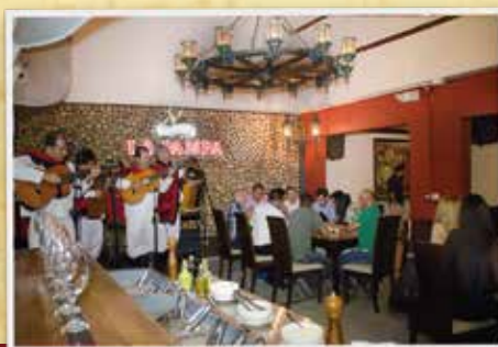
SEGUNDO PARQUE DE LAURELES